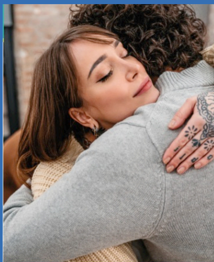
Suicide by Ligature: A Caregivers Support Guide

Brief Description: Within the County of Santa Clara, suicide by hanging has been the number-one method of suicide deaths in the past five years, particularly affecting the Latine and Asian communities. The Suicide Prevention Program responded to this rise in suicide deaths by hanging via a community planning process consisting of: 1) literature analysis, 2) roundtables with providers and community members, and 3) an iterative expert review of program recommendations to prevent suicide deaths by ligatures in the community. The County created a list of recommendations for prevention/intervention efforts; developed and disseminated separate brochures for providers and caregivers to educate the community about suicide by hanging; and created a one-pager document tailored for Santa Clara County providers to utilize when working with clients at risk for suicide by hanging. This work has been featured at the American Association of Suicidology Conference and a SAMHSA webinar for the Governor's Challenge for preventing veteran suicides.