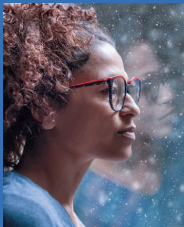
Suicide by Ligature: A Provider's Guide